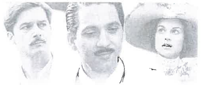
ST. GIUSEPPE MOSCATI

Giuseppe Moscati, "the holy physician of Naples," as a medical doctor and layman in the early twentieth century who came from an aristocratic family and devoted his medical career to serving the poor. His research also led to the discovery of insulin as a cure for diabetes. Moscati regarded his medical practice as a lay apostolate, a ministry to his suffering fellowmen. Before examining a patient or engaging in research, he would place himself in the presence of God. He encouraged his patients to receive the sacraments.